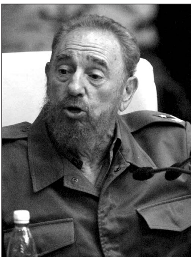
Fidel Castro Cuban Leader