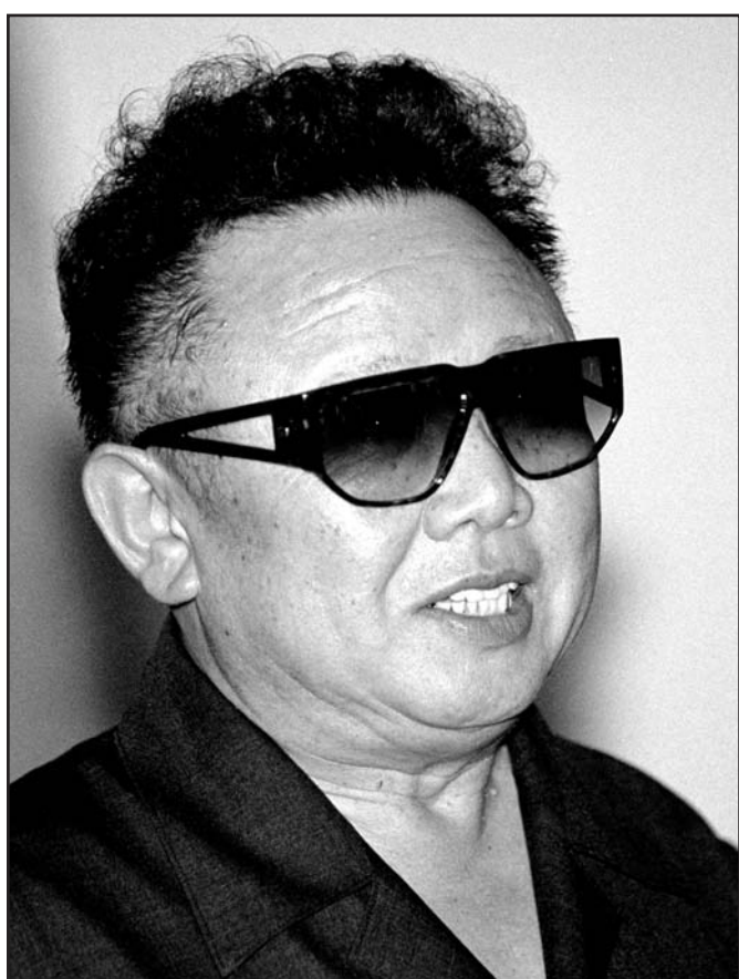
Kim Jong Il North Korean Leader

“There’s no reason to subject the workers to an election.”*