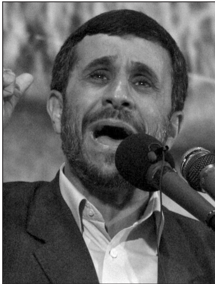
Mahmoud Ahmadinejad Iranian Leader