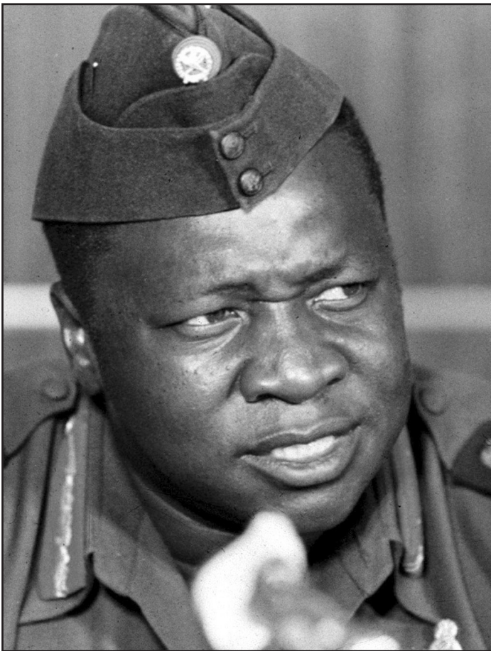
Idi Amin Former Ugandan Leader